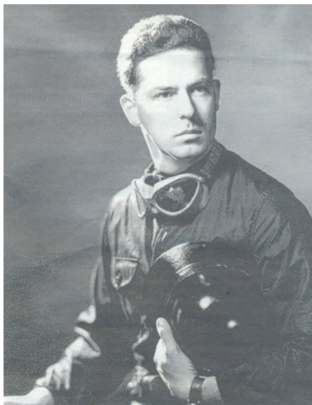
Louth: in his youth he raced cars and motorcycles before turning to boating