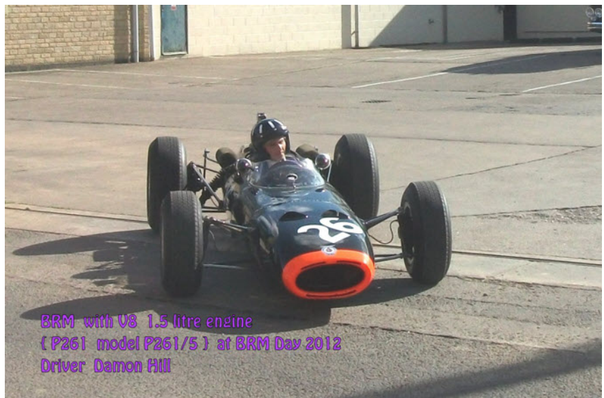
BRM with V8 1.5 litre engine (P261 model P261/5) at BRM Day 2012 Driver: Damon Hill

The DVD of the BRM day can be purchased at the Heritage Centre