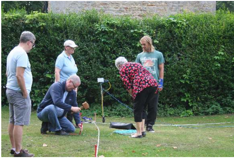
Some members of the Civic Society taking part in the survey